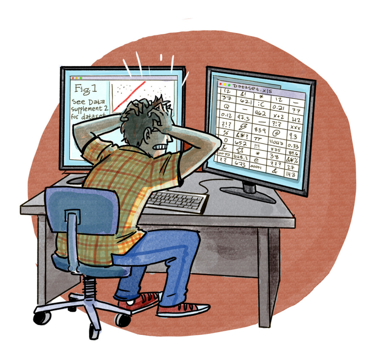
Fig 1. How complete and reusable are publicly archived data in ecology and evolution? The expectation of PDA that exists in genetics and molecular biology is rapidly permeating throughout ecology and evolution. With the advent of data archiving policies and integrated data repositories, journals and funders now have effective means of mandating PDA. However, the quality of publicly archived data associated with experimental and observational (nonmolecular) studies in ecology and evolution is highly variable. Illustration by Ainsley Seago.